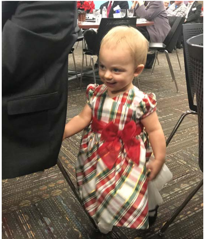
The one that got away!