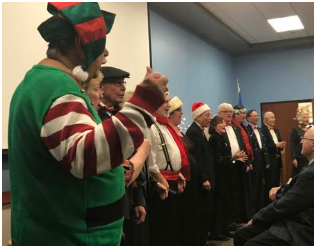
The Holiday cheer filled every ear and had SOME folks on their feet at times!

Last week was our annual Holiday Song festival with the Flint Master Singers. If you missed it – here are the highlights.