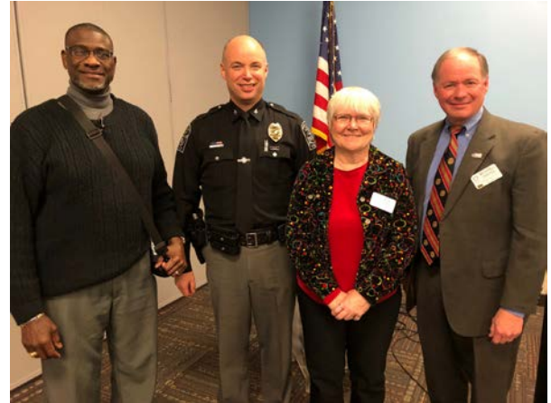
Law enforcement and community groups.

ALPACT members examine issues affecting police and community relations and the discriminatory enforcement of laws, such as racial profiling, police discretion, use of force, recruitment and training, citizen complaint processes, community partnering, police leadership and management, and disciplinary practices designed to enhance the bonds of trust between law enforcement and the communities they serve; and to present and recommend implementation strategies to