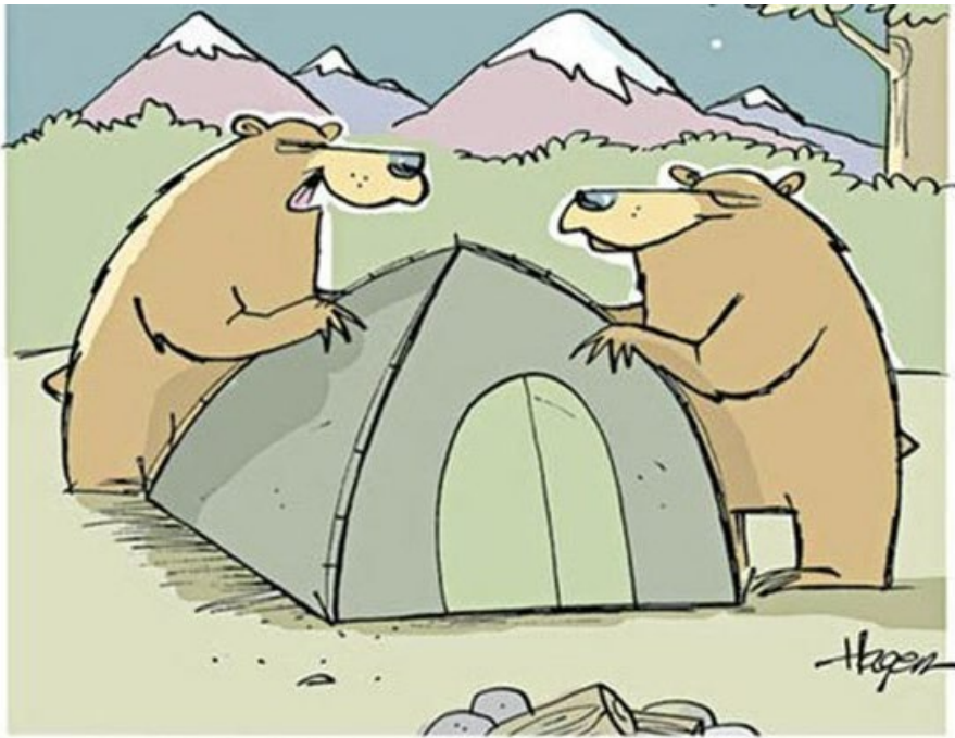
"I just love how they come individually wrapped to seal in the flavor."