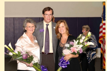
Co-Chairs with bouquets and Emcee