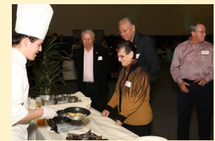
Club members enjoying the event