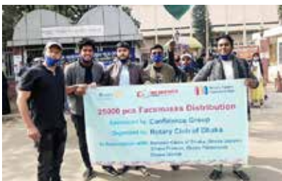
Rotaract and Rotary clubs in Dhaka distributed 25,000 masks in April.

Together with our four sister clubs, we distributed 25,000 facemasks to people in the public areas of Dhaka in April, where people go to work to earn their livelihood. They are vital to our economy and it's important for us to protect them.