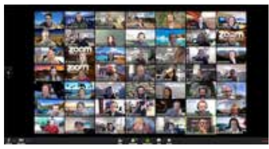
Keep members engaged through virtual meeting platforms.