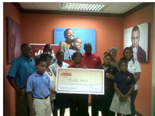
Representatives from Early-Act, Interact, Rotaract and Rotary awarding cheque in the amount of $100,000 to Melody Girl's Home on Wednesday, September 19.