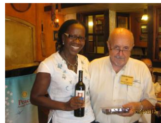
Photo Recap for last week: