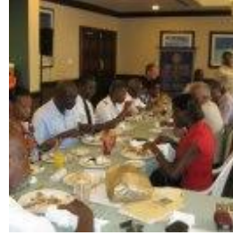
Photo Recap of last week's meeting: Almost 2/3rds