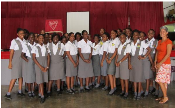
Liceo Montessori school