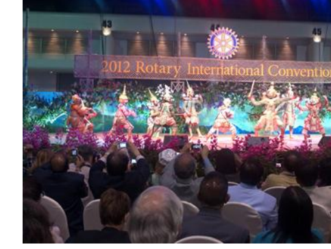
Rotarians singing , dancing and felloshiping