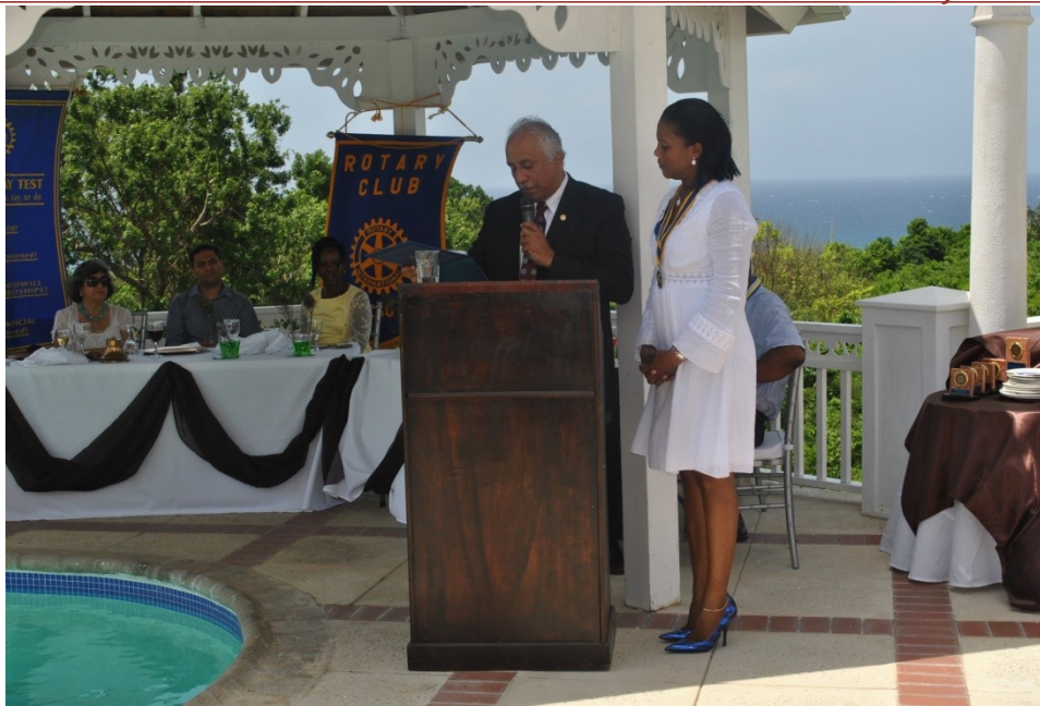
Outgoing Pres. Mexine listening to a Citation from Rotary International in recognition of Rotary Club of Montego Bay's 50 th Anniversary