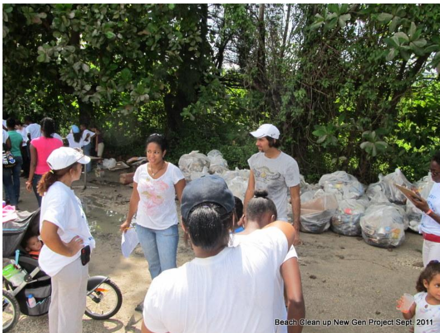
Beach Clean up New Gen Project Sept. 2011