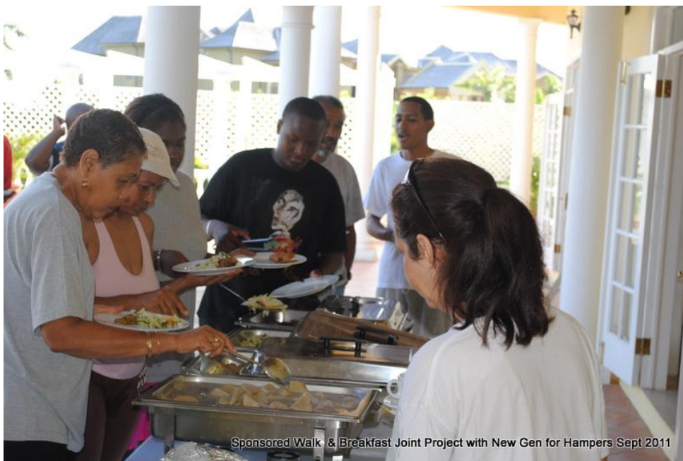
Sponsored Walk & Breakfast Joint Project with New Gen for Hampers Sept 2011