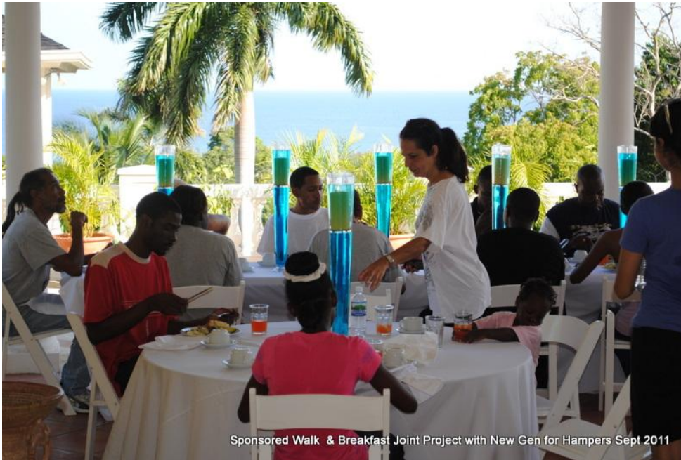
Sponsored Walk & Breakfast Joint Project with New Gen for Hampers Sept 2011