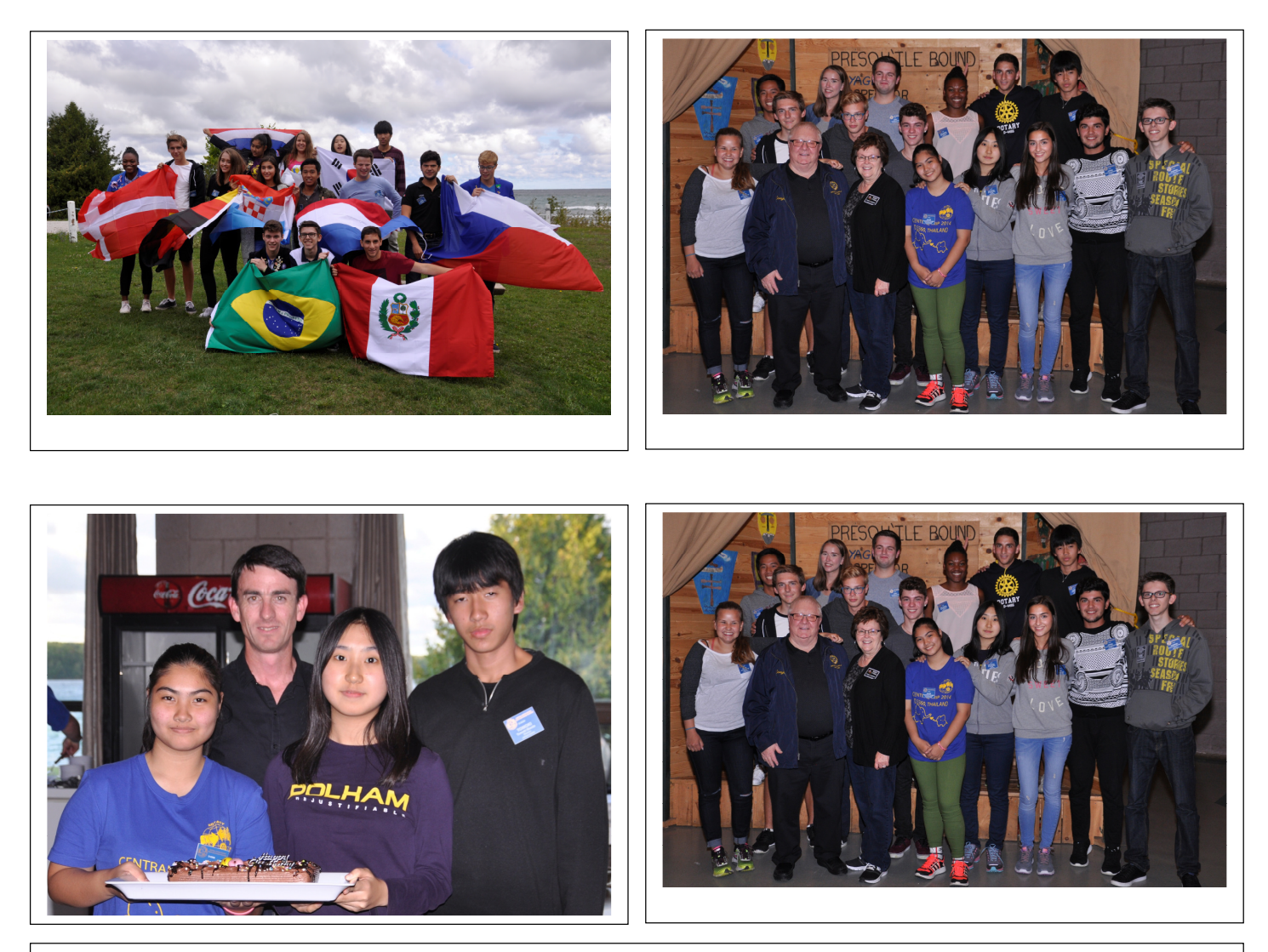
The Youth Exchange Fall Conference at Presquile Camp

The Annual Youth Exchange Fall Conference was held at Presquile Camp near Owen Sound Ontario from Friday September 11<sup>th</sup> to Sunday September 13<sup>th</sup>. Attending were the District Youth Exchange Chairs and Coordinators as well as the 15 newly arrived Inbound Students to our District 6330. This was an opportunity for the students to meet each other and to participate in group activities in a camp environment including hiking, sleeping in cabins, and providing a talent show. Next Conference gathering will be held in St Clair Michigan October 23<sup>rd</sup> to October 25<sup>th</sup>.