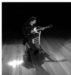
Group Guitar lessons

We will be having a meeting in early 2017, if you would like to be involved please email us or call to let us know and help our garden grow.