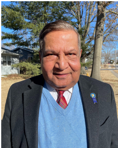
SK Nanda Foundation Chair