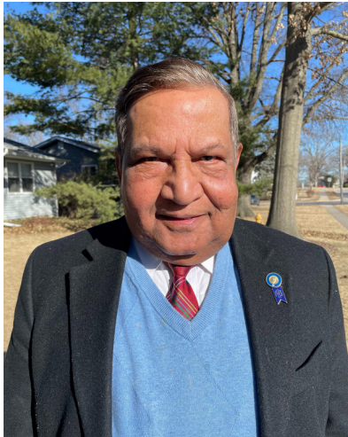
SK Nanda Foundation Chair