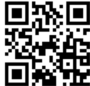
QR Code for guest dinner (only needed if the guest is not golfing)