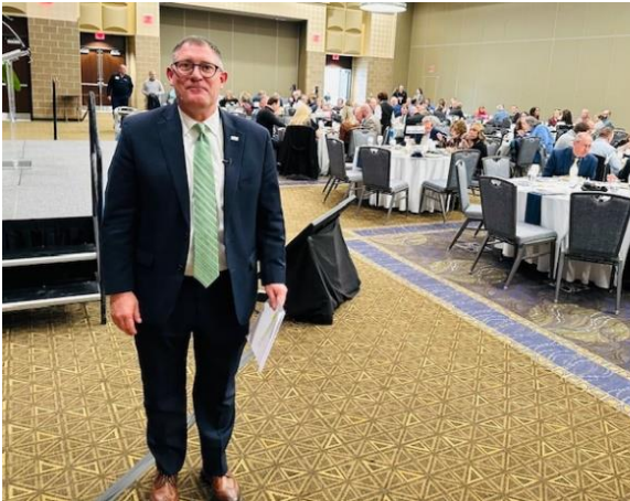
It’s Go Time. Does this guy look nervous? Heck, no. He’s money.