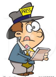
illustrations of.com #1157339