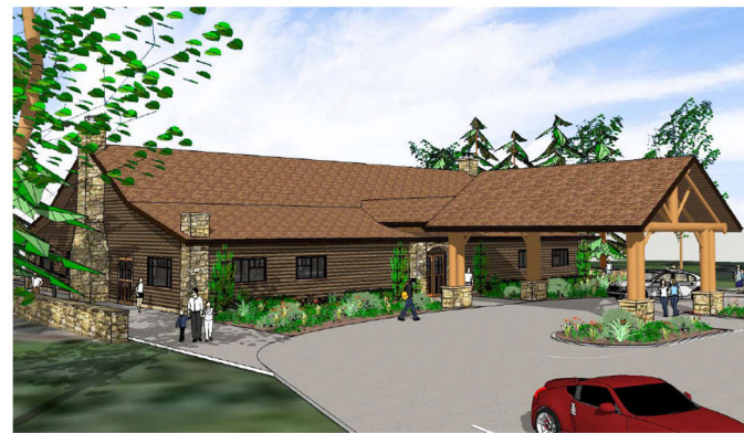
grand front entrance