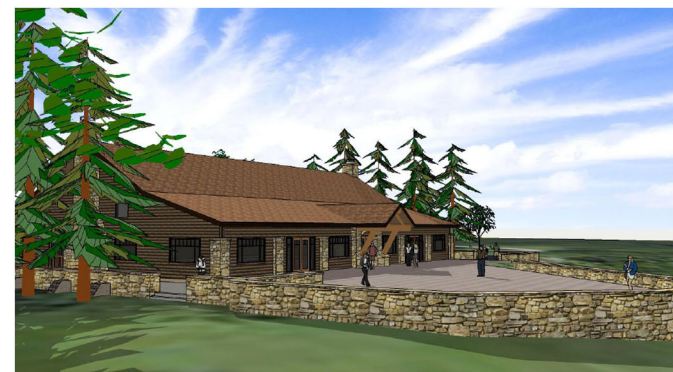
expanded veranda facing river