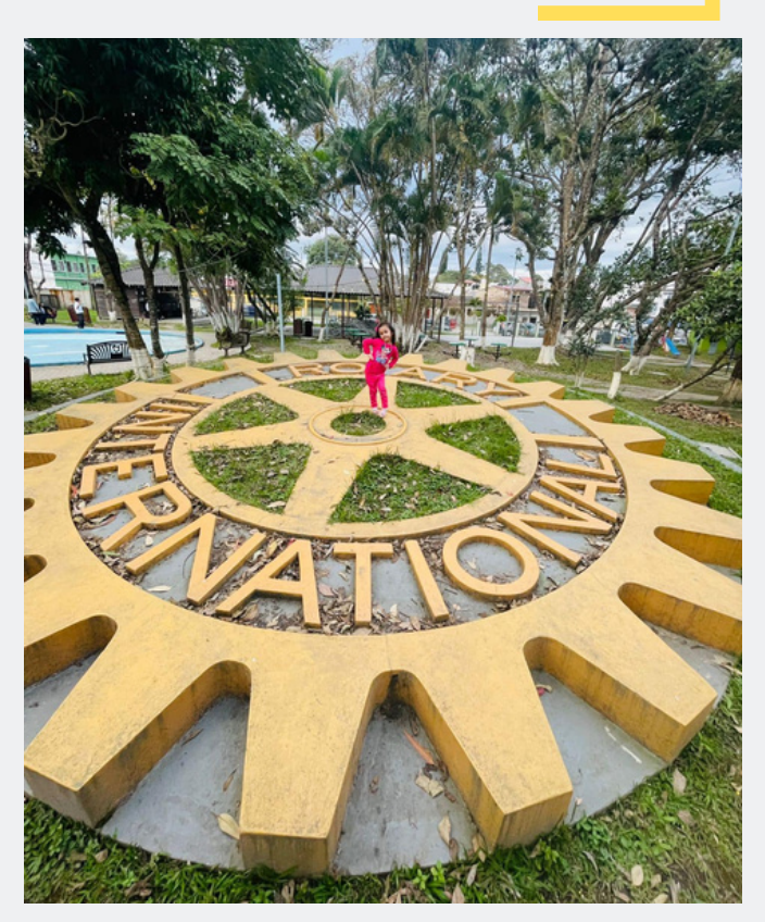
Rotary Wheel built in the Children's Park of Santa Rosa de Copá