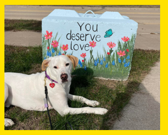
Chance, the Therapy Dog

Email: <u>speakoutcamanche@gmail.com</u> https://www.facebook.com/SpeakOutCamancheIA https://speakoutiowa.org/