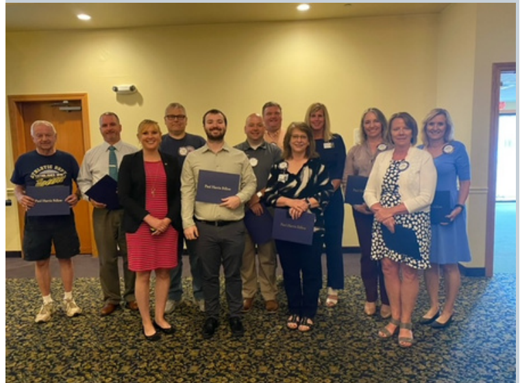
PAUL HARRIS FELLOWS