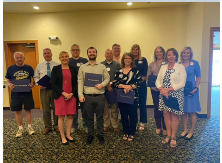
PAUL HARRIS FELLOWS