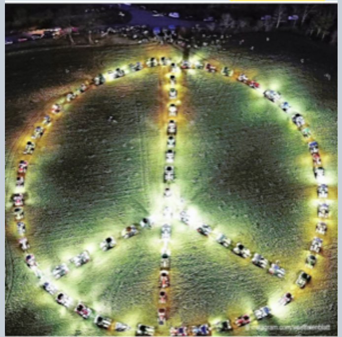
FARMERS IN THE GERMAN TOWN OF HERFORD, NORTH RINE-WESTPHALIA CREATED THIS XXL PEACE SIGN (120 METERS) WITH THEIR TRACTORS.