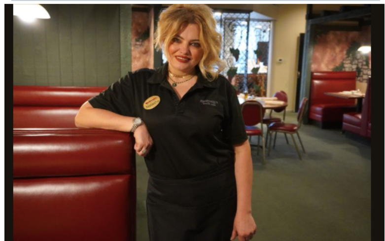
Iowa Restaurant Association