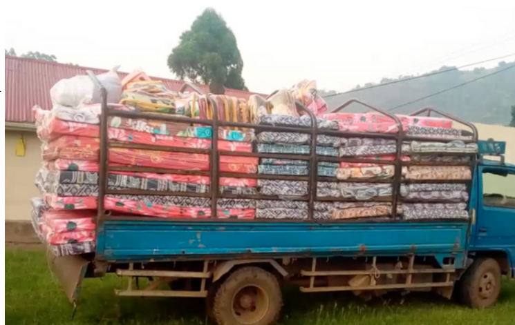
This truck is full of mattresses and bedding for all 56 kids at the Center.

Thank you, Merle, for all that you do in helping these amazing kids!