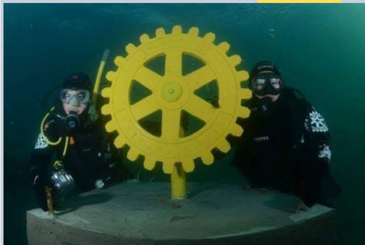
Surface above self

Did you know there is an International Fellowship of Rotarian Scuba Divers!? This fellowship, has members from all over the world and they organize one or two diving expeditions per year to exotic locations.