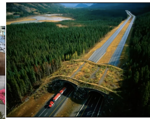
IN THE DAKOTAS.