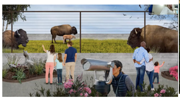
WHAT THE BISON BRIDGE COULD BRING - TOURISM ABOVE IMAGE IS A WILDLIFE BRIDGE AND LEARNING.