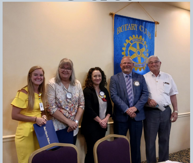
Congratulations to our Paul Harris Fellows!