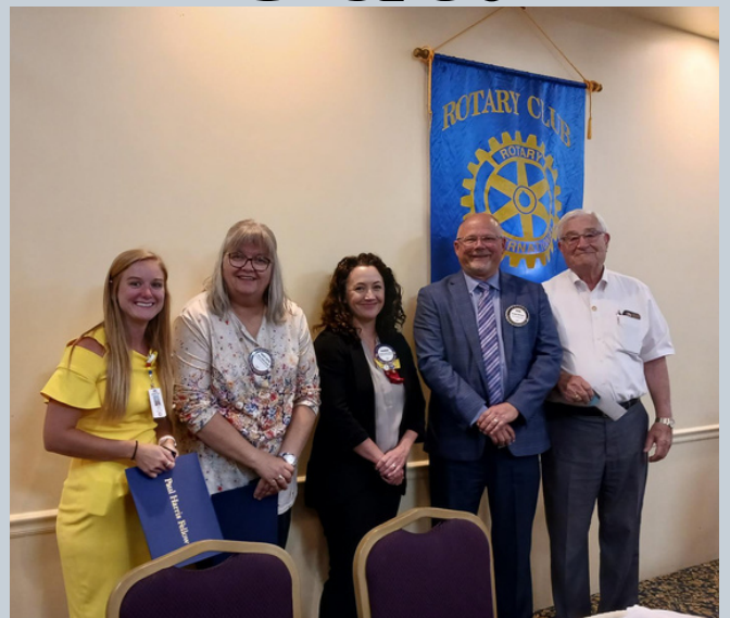
Congratulations to our Paul Harris Fellows!