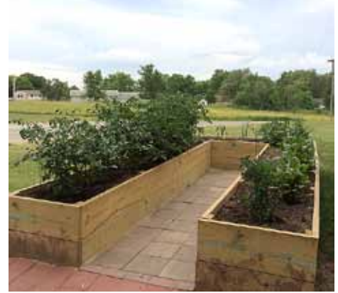
The raised bed after six weeks of growth and maintenance by Rotary Club of Decatur County.