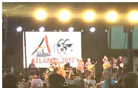
Blue jeans vigil for human trafficking.