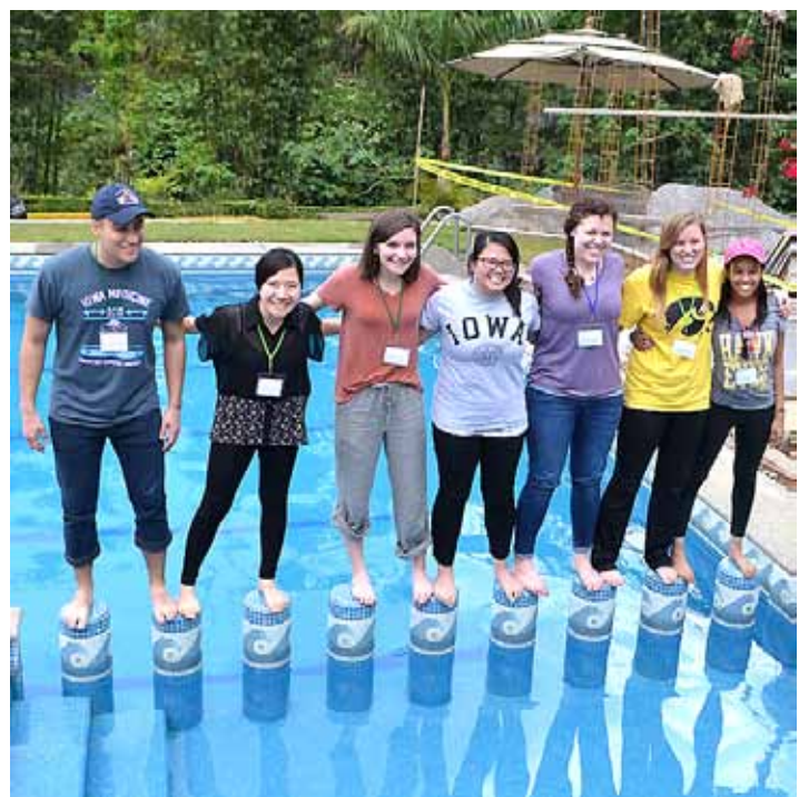
University of Iowa Pharmacy students walking on water.