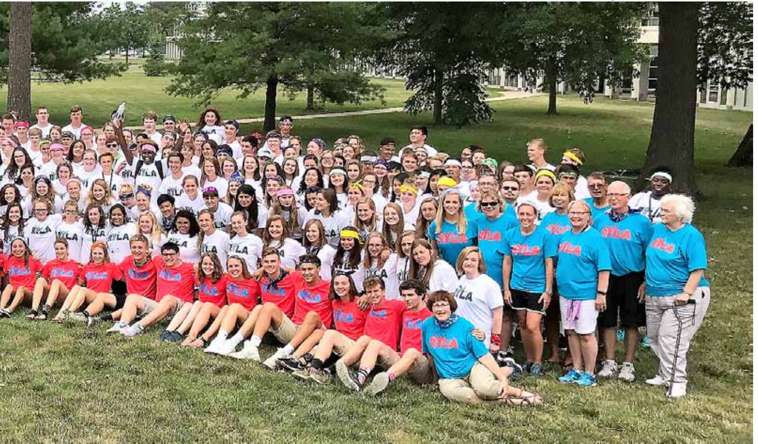
Grinnell College July 16-20 for leadership training. More photos and articles are on the next pages.