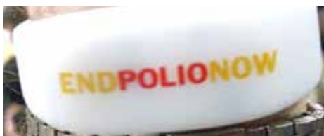
End Polio Now bracelets.