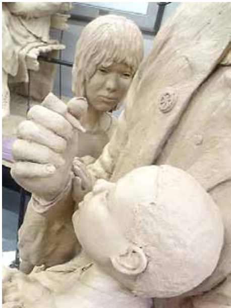
A Rotary pin is added to the jacket.