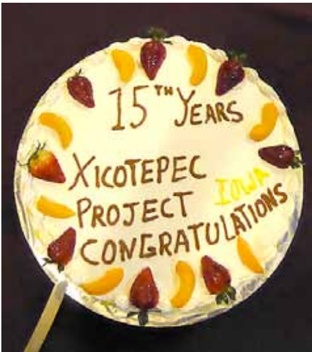
2017 was the 15th year that project teams have come to Xicotepec from D6000.