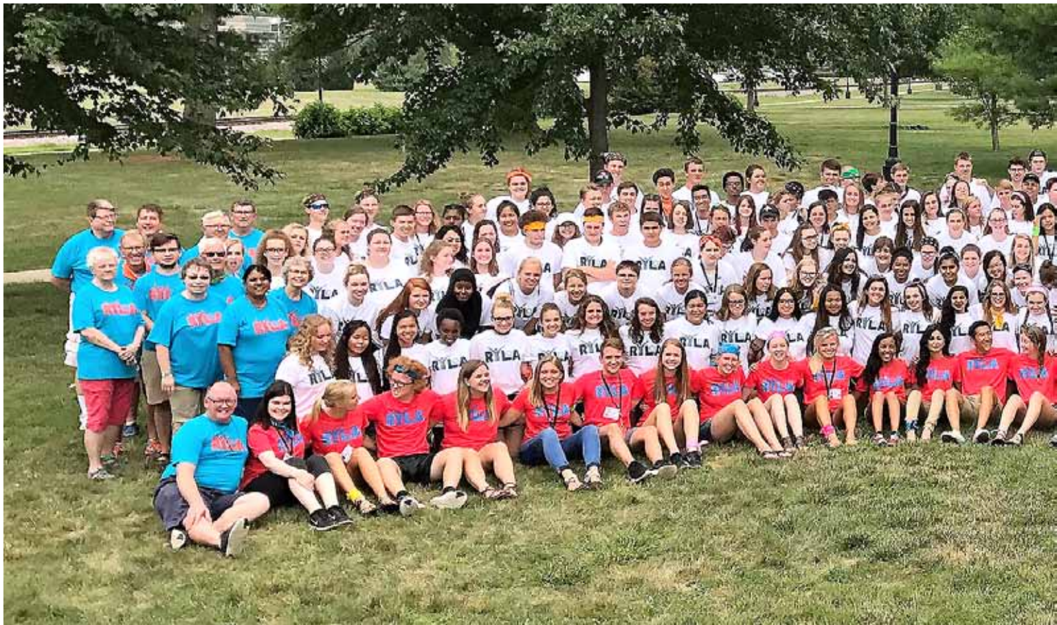
Districts 5970 of northern Iowa and 6000 of southern Iowa co-sponsored Iowa RYLA which brought 240 high school students to