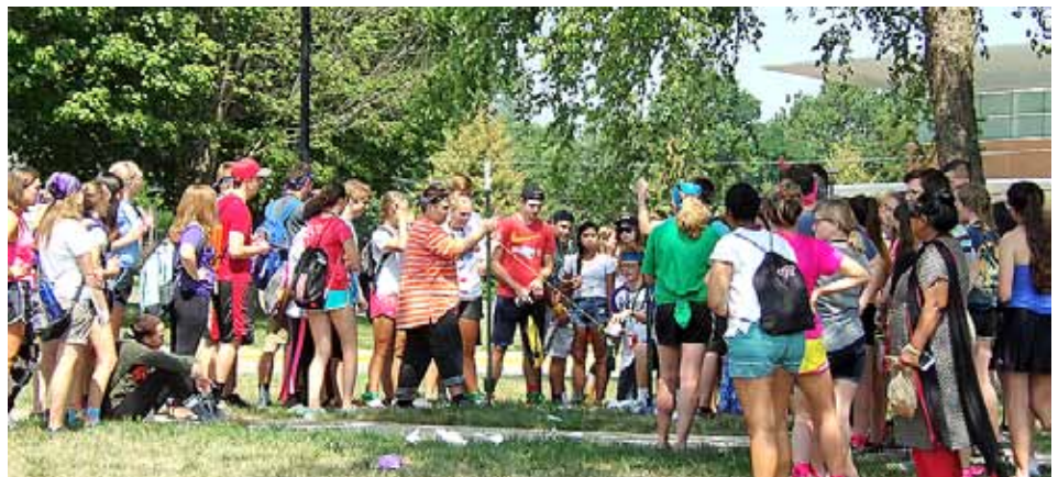
The egg launch was one of the team building activities.

Both RYLA and YRYLA have the potential to changed participants’ lives for the better and to instill in young people – tomorrow’s leaders – “Rotary’s values of service, high ethical standards, and peace.”