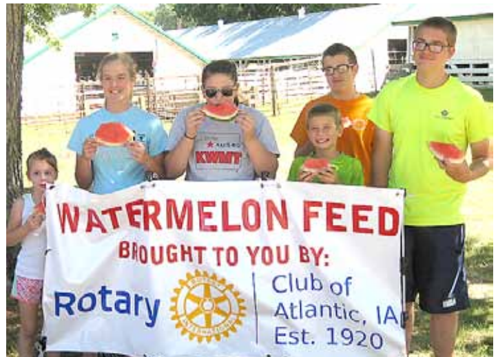
Watermelons served to youth by Rotarians at the Cass County Fair are a big hit!

With school getting started, the club holds its annual New Teacher Welcome. This year there were eight new teachers and two new administration positions.