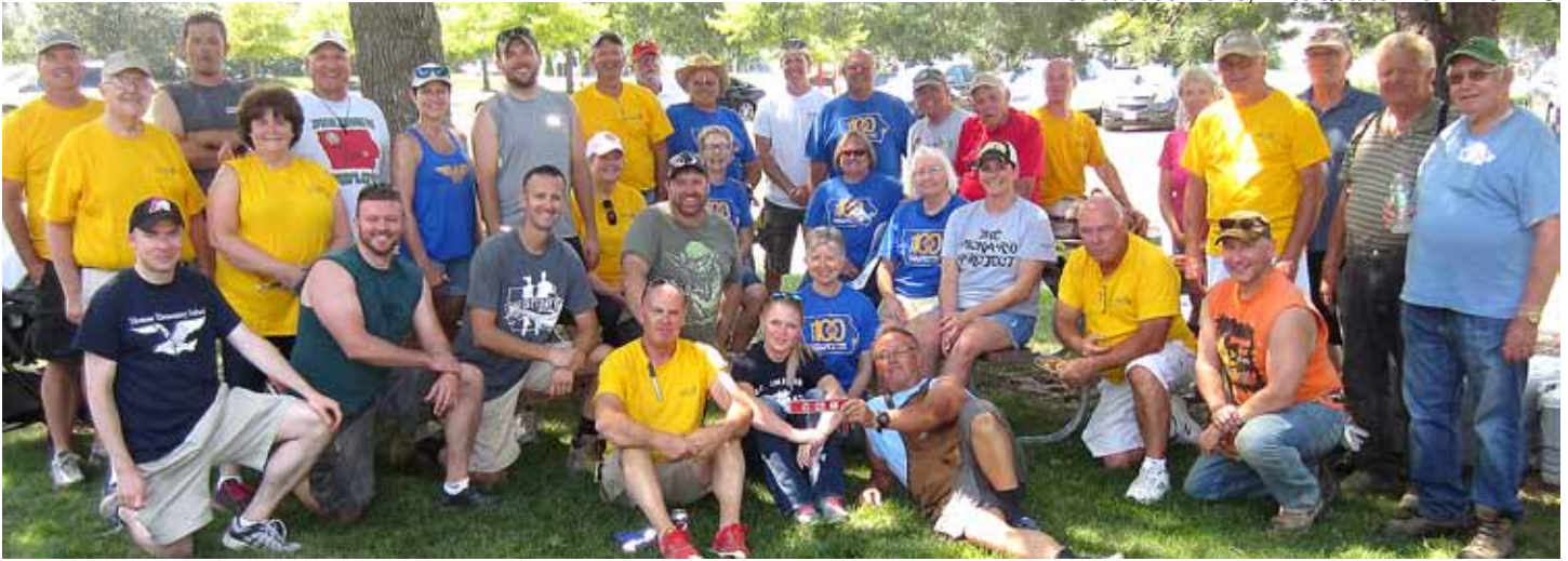
Thirty-four workers break for lunch during installation of the $155,000 Play and Park national demonstration handicapped playground in Eldridge on Aug. 19. More than 50 volunteers assembled the huge playground in two days.