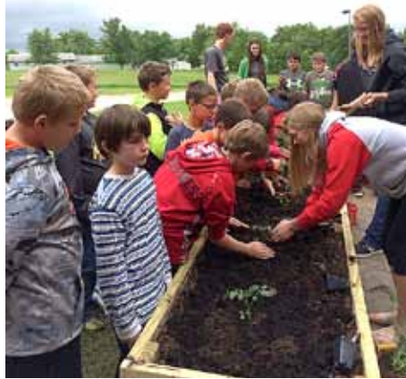
Student leaders of ROCCS helped fourth grade classes to plant the beds.