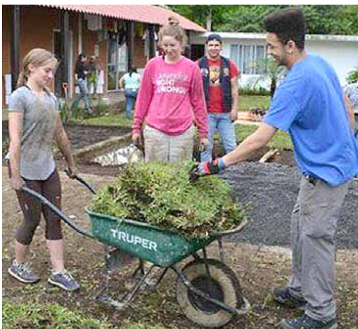
Iowa Interactors at work landscaping the lawn and garden area of the Damas Vicentinas home for senior citizens.

and related vocational skills to secondary school students in a rural school in Mecatlán de las Flores.