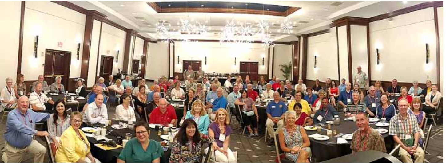
Ninety Rotarians and guests attended the largest District 6000 Breakfast ever at the Double-Tree Hotel in Atlanta the morning of June 12.