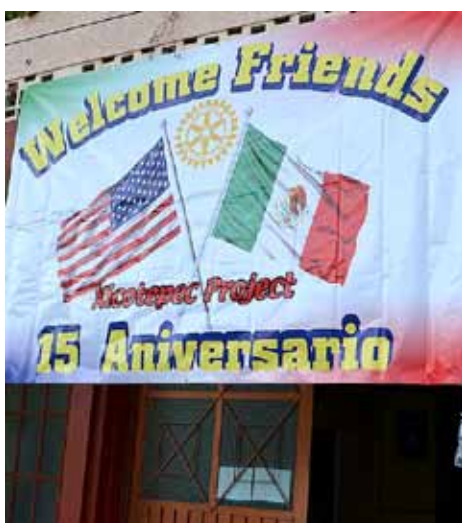
One of many ways in which Iowans are warmly welcomed to Xicotepec.