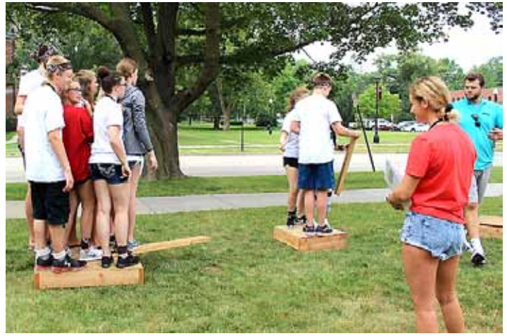
All aboard ...