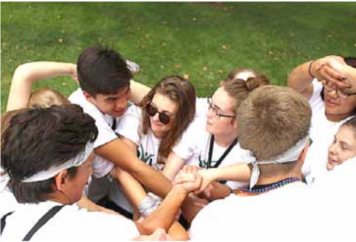
The human knot ...