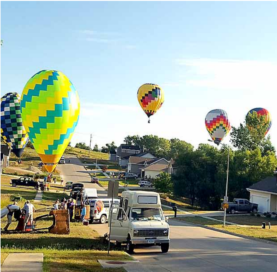
Rotarians sell tickets and direct traffic at the National Balloon Classic in Indianola.