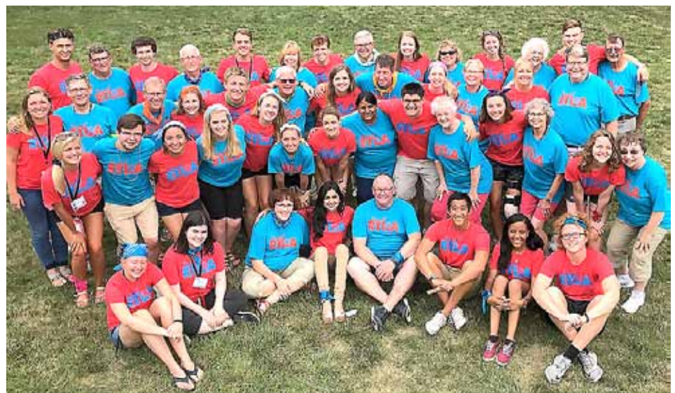
Rotarian volunteers, pictured in turquoise t-shirts, served as advisors and facilitators, and RYLA veterans, in coral tees, led teams as counselors.