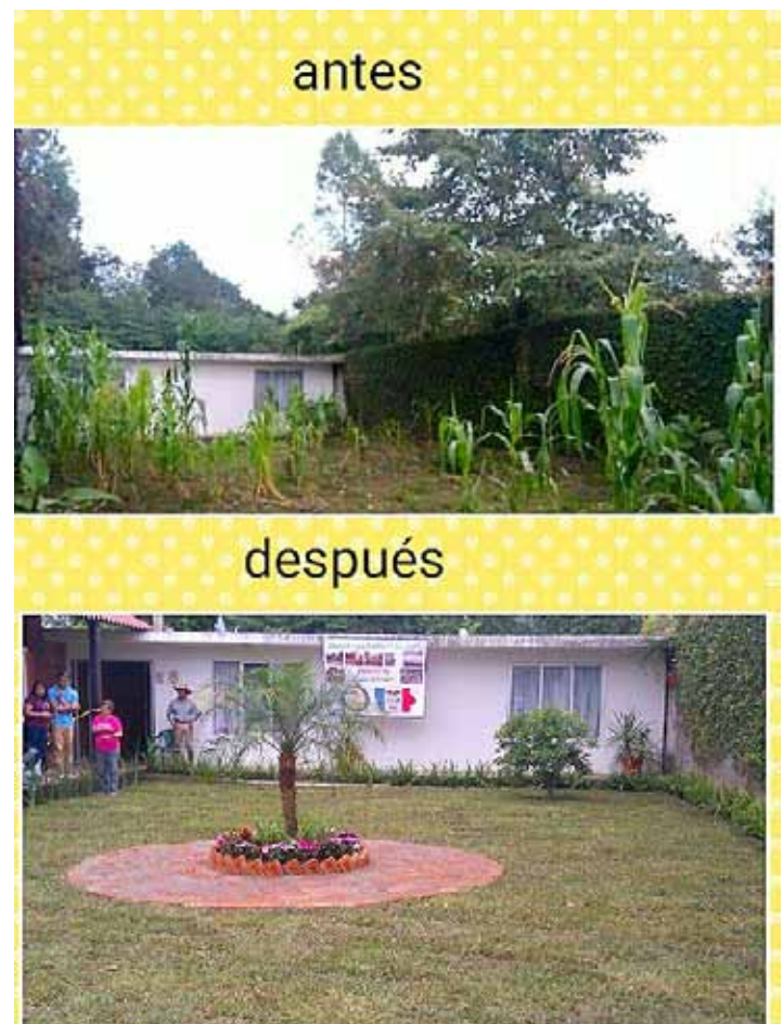
The Interactors' landscaping project, before and after.

Tax-deductible contributions to help with projects in Xicotepec can be made to D6000 HEF; contributions should be sent to Phil Peterson, Treasurer, Rotary District 6000 HEF, P.O. Box 5774, Coralville, IA 52241-5774.