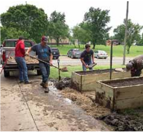
Raised bed construction by Central Decatur's industrial technology class and TSA members. The bed design was selected by students.