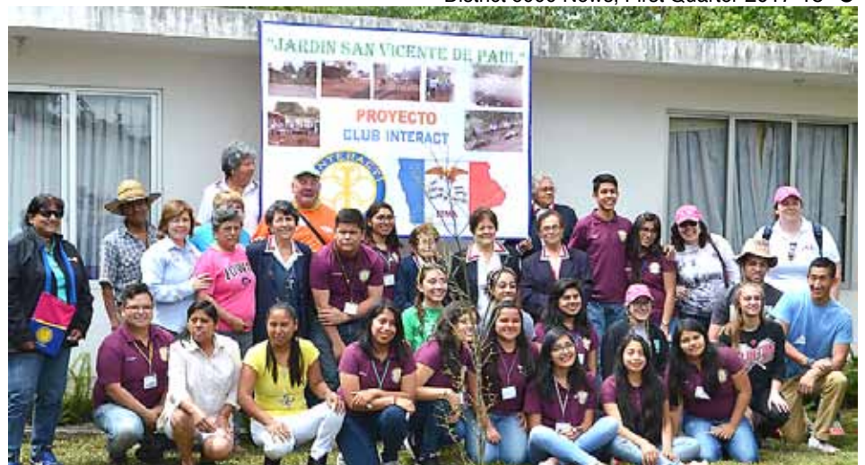
The team that did the work – Xicotepec Interactors are in purple shirts, Women of St. Vincent de Paul are in blue suits, and Iowa youth and Rotarians are the others.