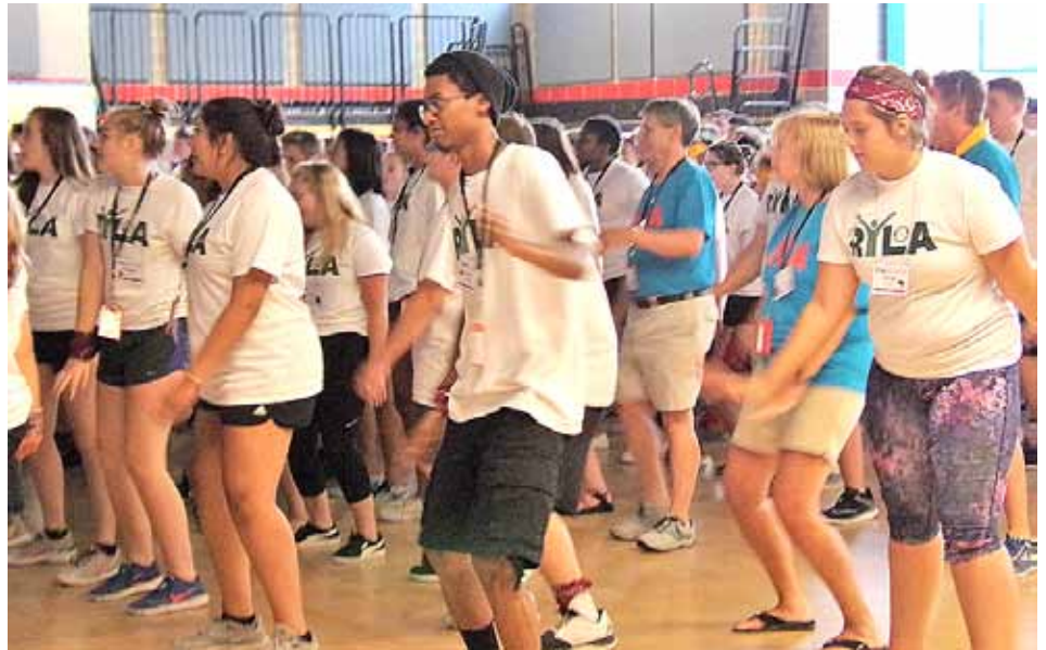
RYLA was a high energy experience for 240 Iowa high school students July 16-20 at Grinnell College.