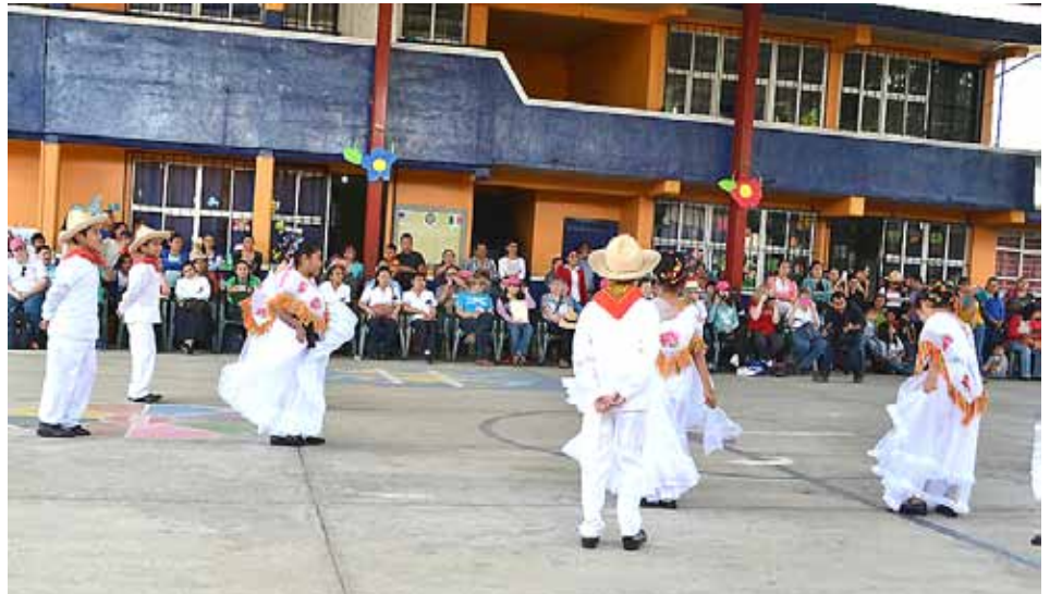
On Friday, project team members were treated to a performance at the Escuela Club Rotario.