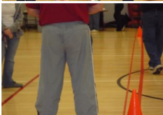
Some one seems to have a problem. Guess who it is