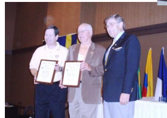
President Chuck is awarded the Governor's Award. Only two clubs in District 6000 achieved this award.