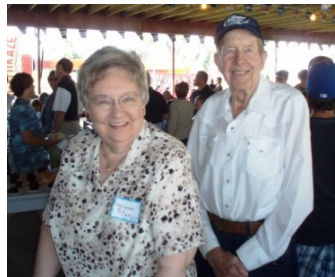
Long Time Members