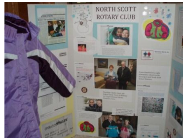
Operation Warm Poster Presentation at District Conference