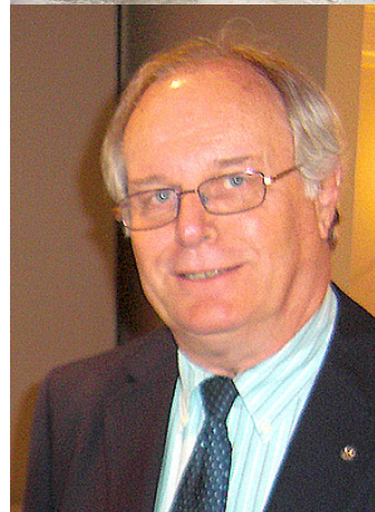
Our New gentleman Sheriff