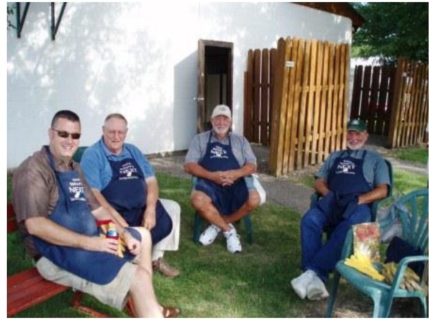
Our Corn Boil Crew takes a break from the heat of their hard work with the corn boiler

September 9: GOLF OUTING: Invocation: Adam Kerns; All other duties covered by Golf committee members.