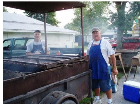
The Pork Producers grill our Pork Chops to perfection