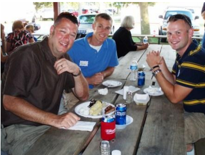
Remember last years Bachelor Table