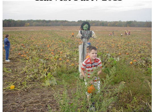
The Pumpkin Patch