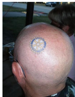
Is that a real Tattoo