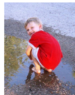
Some found other ways to pass the time.