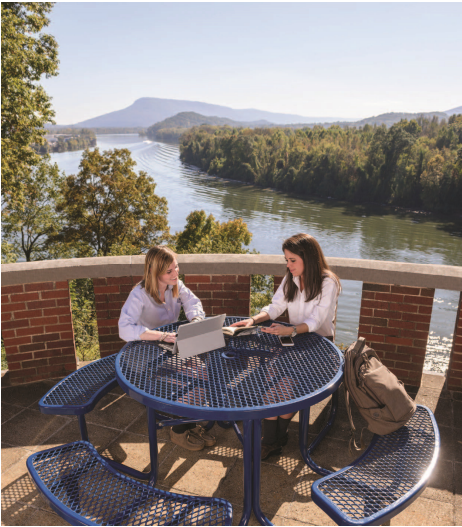
Two tables with seating for 8

as submitted to District 6000 includes these items. In addition the bases and installation is included. This installation will be in support of our Playground at Sheridan Meadows Park in Eldridge, Iowa.