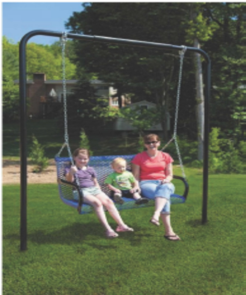
Two multi generational swings (for us oldies)