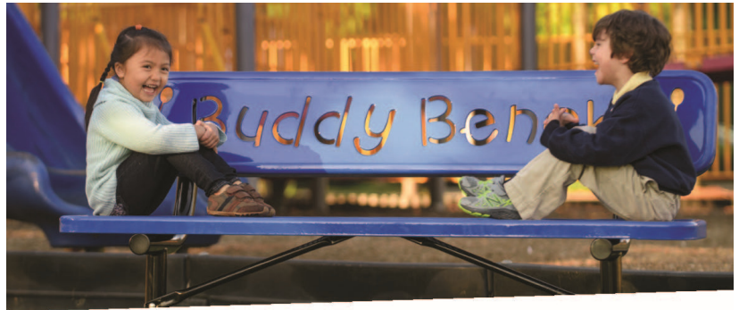
One Buddy Bench to make new friends.