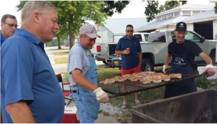
At Left The Chops are just about ready