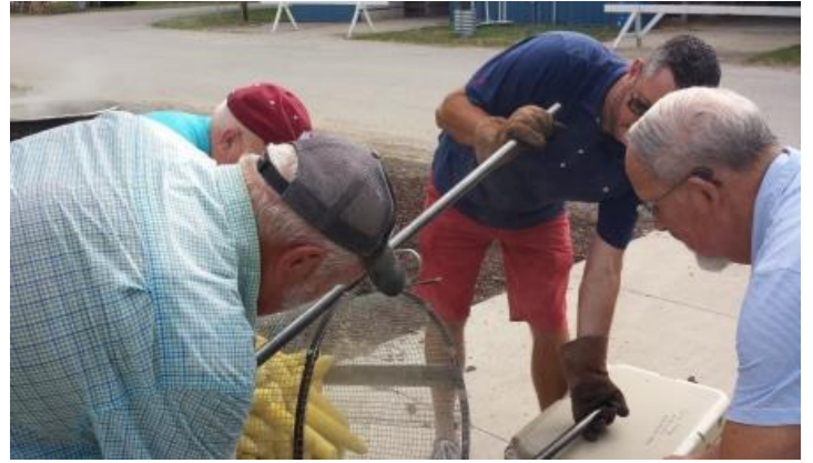
Food Preparation Above are Corn Boil Committee