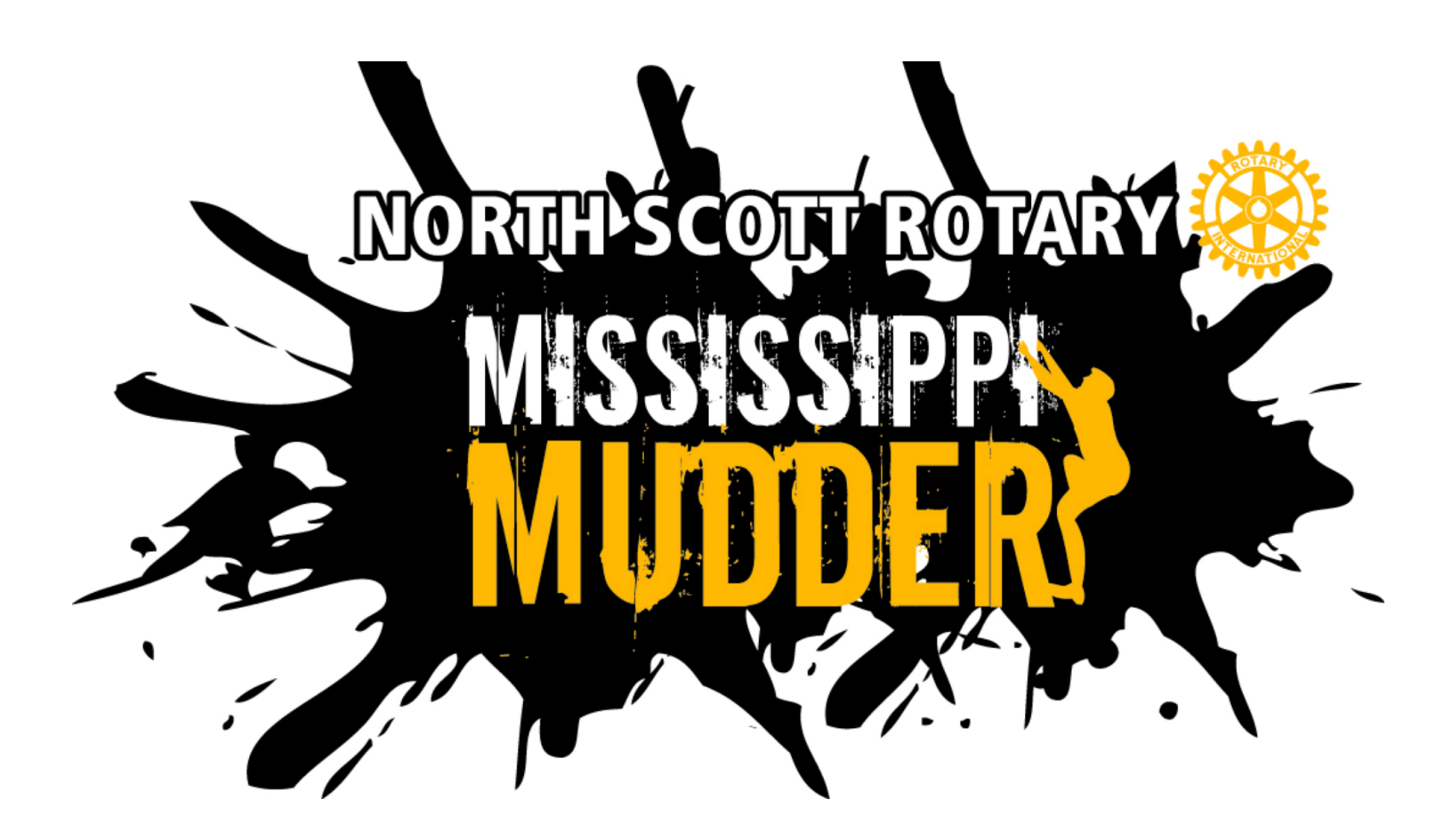
Saturday August 17th 2019 7 AM to close (Help needed at 6 AM)

The North Scott Rotary Mississippi Mudder is a 5K mud run obstacle course filled with 30+ obstacles.