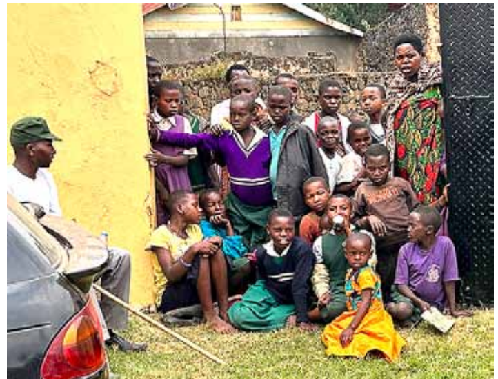
Children at the gate watched the June 23 celebration of kids at Imbabaze Centre for Women and Children in Kisoro, Uganda, with their Rotary sponsors, wishing to be included.

The Centre is a major project of North Scott Rotary in partnership with other clubs and The Rotary Foundation since 2015. Fifty-seven orphans and vulnerable children receive private school education and uniforms, thanks to individual sponsors. Seven Rotarians and Doug met the children and saw our projects in June. Kisoro, in the SW corner of Uganda, is five miles from Rwanda and 10 miles from the Congo. Elevation is 8,000 feet. A variety of crops are grown on the rocky terrain.