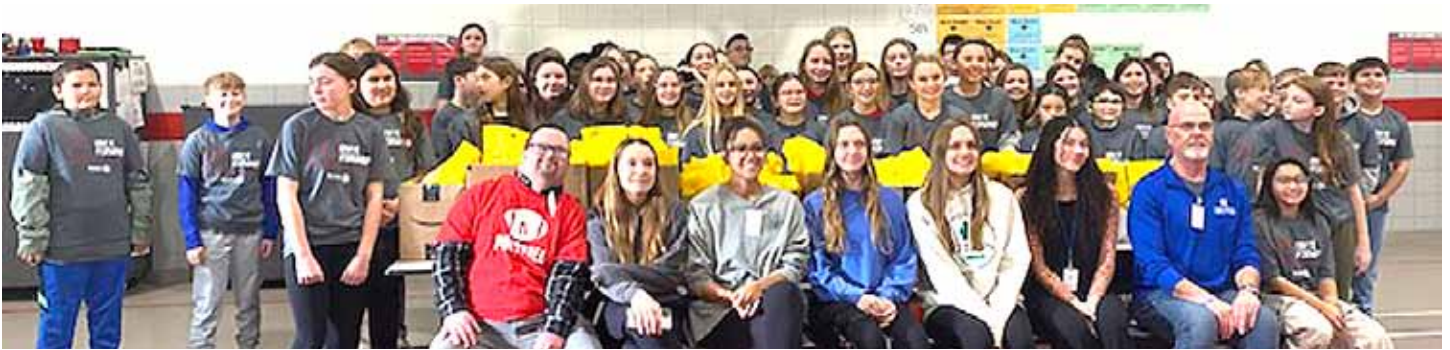
Ed White students at Pay It Forward day, Dec. 8.