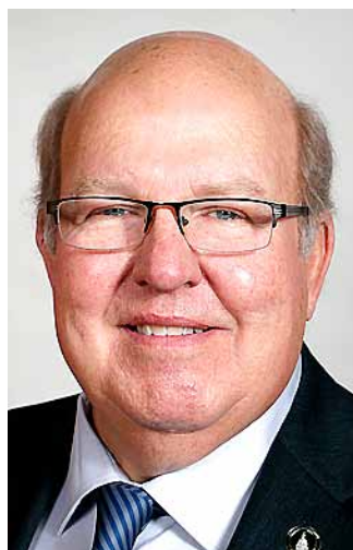
Rep. Gary Mohr

(* ) https://www.legis.iowa.gov/legislators