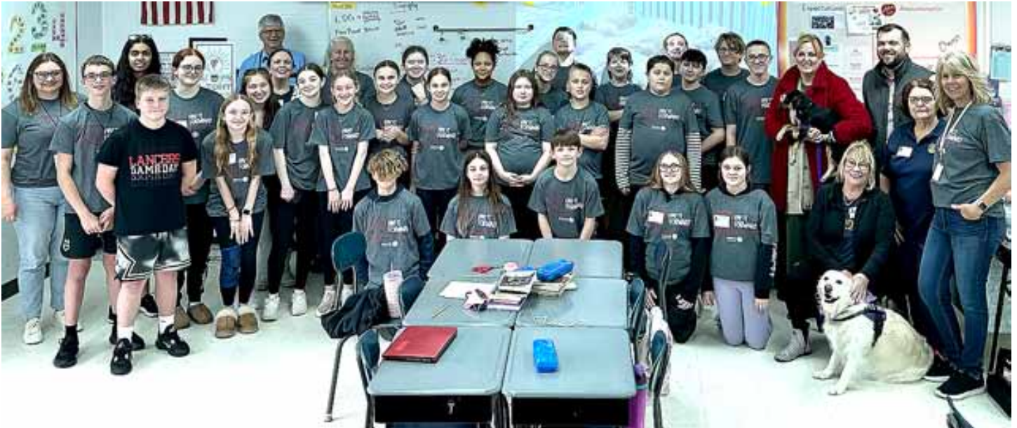
APRIL 3, 2024: Sixth-graders at Virgil Grissom Elementary in Park View with Rotarians and NSHS service club members, "Paying It Forward" for the Quad-City Animal Welfare Center. Students learned about animal care and filled bags for cats and dogs.