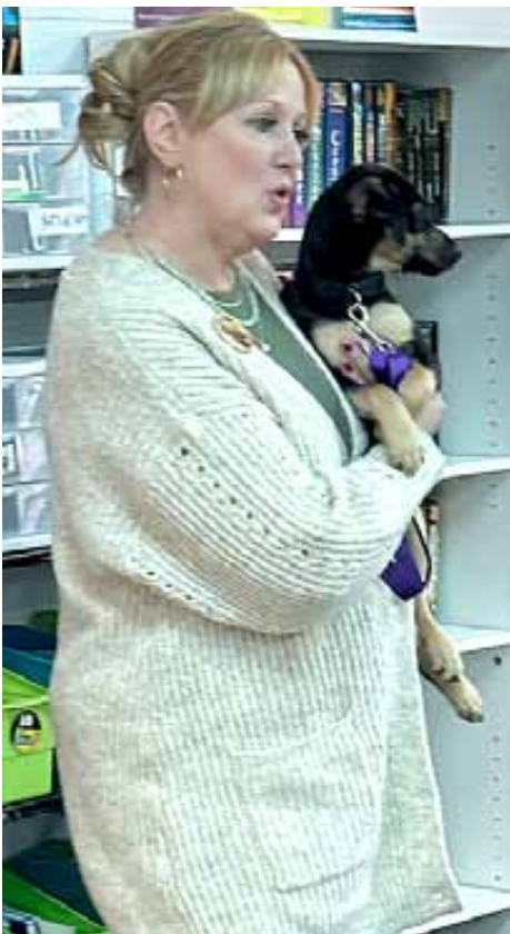
Students learned about the King's Harvest no-kill pet shelter.