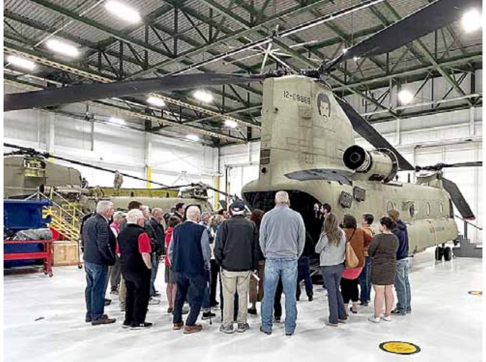
Rotarians and guests huddle around one of six CH-77 Chinook helicopters at the Army Aviation Support Facility at the Davenport Airport. One unit costs $35 million, has a range of about 300 miles, carries 1,000 gallons of fuel, and can sling load 25,000 pounds.