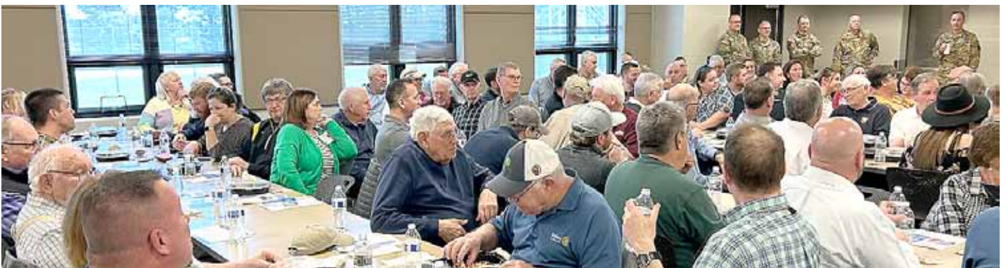
Our Rotary meeting was in a large conference room.