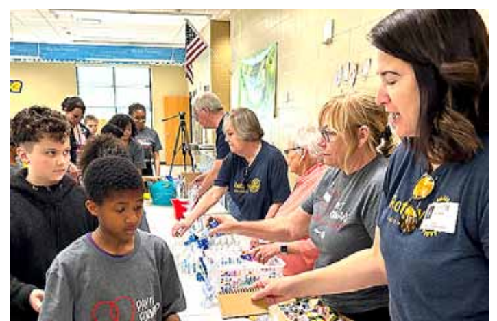
Rotarians help students fill baskets for senior citizens.