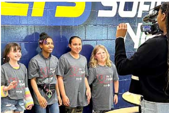
Students, wearing Rotary "Pay It Forward" shirts, say "Hello Quad Cities" for the KWQC-TV audience.