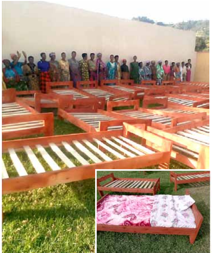
Bed frames built locally in Uganda @ $14 will protect the mattresses purchased by North Scott Rotary for the children at ICWAC.