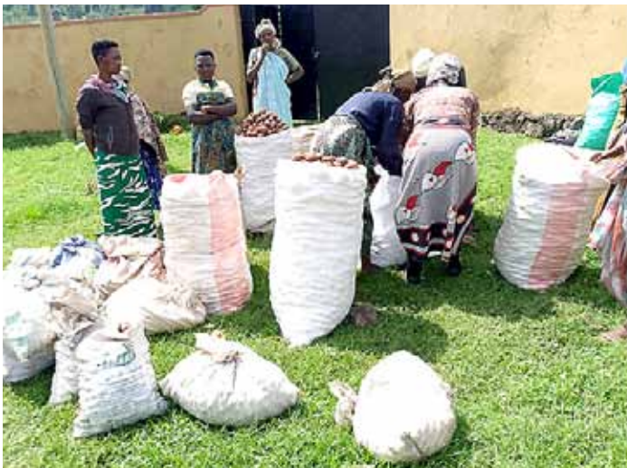
A successful potato harvest.