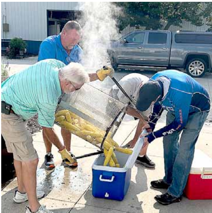
Corn boilers at work.