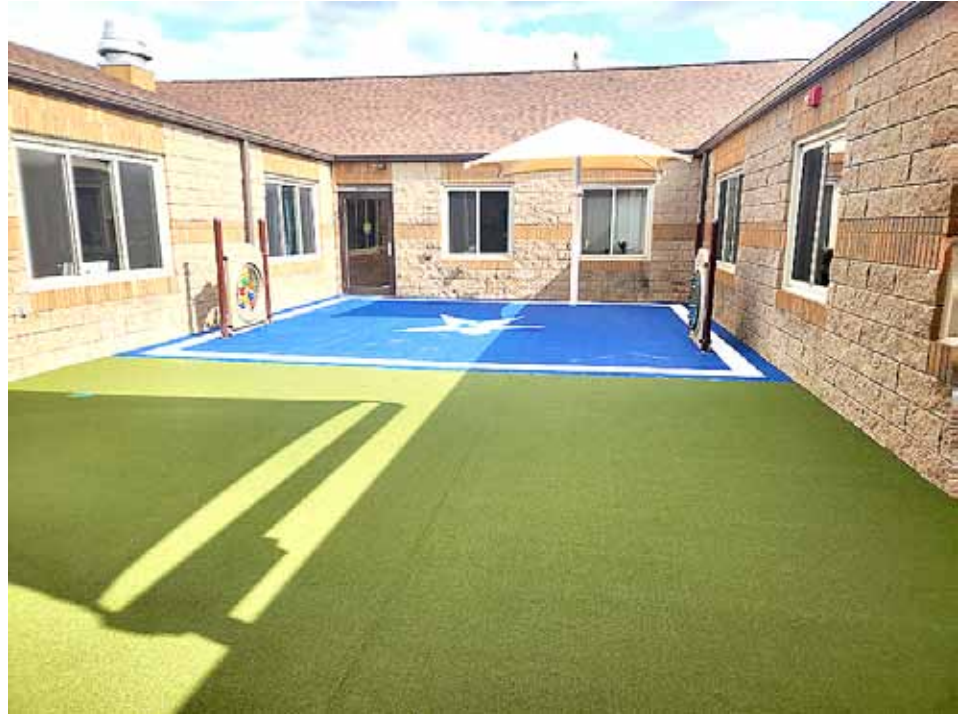
The nearly finished project.