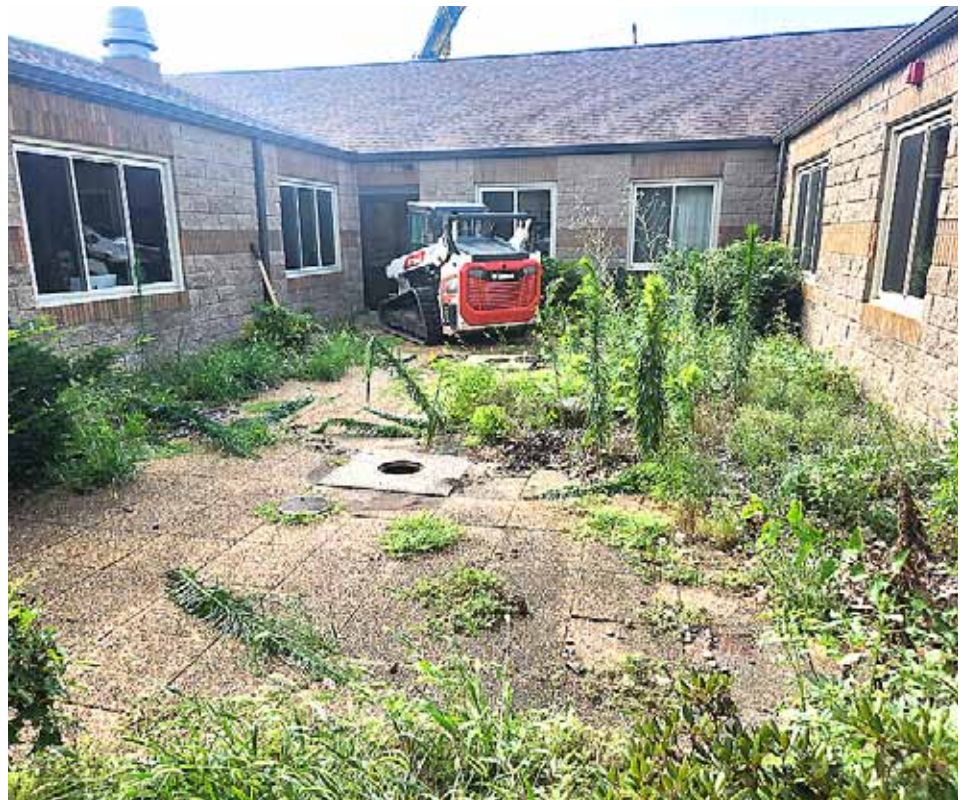
Before: Overgrown and in disrepair.